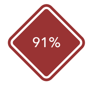
Presenter's knowledge of the subject matter.