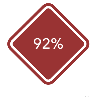
Presenter was well prepared.

Below shows the percentage of workshop attendees that rate us as Excellent in the following categories: